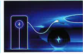
Installation & Integration